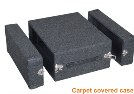
Carpet covered case